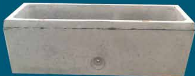
150 GALLON CONCRETE BOTTOM FILL TROUGH

1850 MM LONG • 742 MM WIDE • 450 MM HIGH