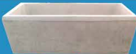
300 GALLON CONCRETE BOTTOM FILL TROUGH

2286 MM LONG • 1276 MM WIDE • 730 MM HIGH • 1200KGS