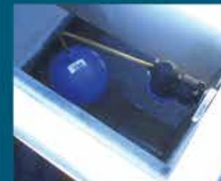
BALLCOCK FAST FILL C/W FLOAT & TANK CONNECTOR