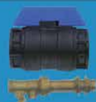
BALLVALVES AND BALLCOCKS