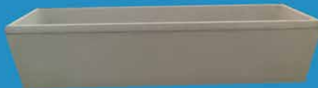
500 GALLON CONCRETE BOTTOM FILL TROUGH

2286 MM LONG • 1276 MM WIDE • 730 MM HIGH • 1200KGS