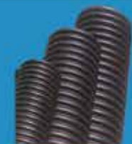
TWIN WALL / CORRI PIPE