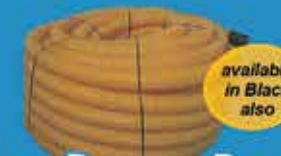
LAND DRAINAGE PIPE