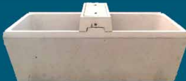
300 GALLON CONCRETE TOP FILL TROUGH

2286 MM LONG • 1276 MM WIDE • 730 MM HIGH • 1200KGS