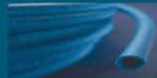
MDPE BLUE PIPE