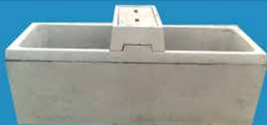
150 GALLON CONCRETE TOP FILL TROUGH

1940 MM LONG • 915 MM WIDE • 625 MM HIGH • 750KGS