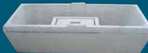
40 GALLON CONCRETE TOP FILL

1500 MM LONG • 509 MM WIDE • 390 MM HIGH • 333KGS