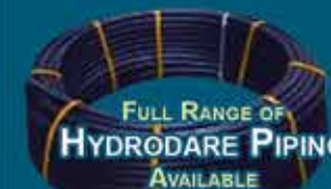
FULL RANGE OF HYDRODARE PIPING