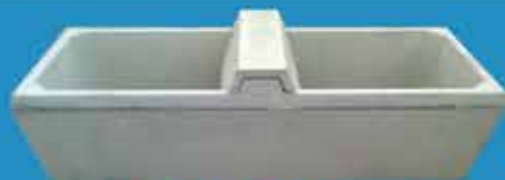
75 GALLON CONCRETE TOP FILL TROUGH

1500 MM LONG • 509 MM WIDE • 390 MM HIGH • 333KGS